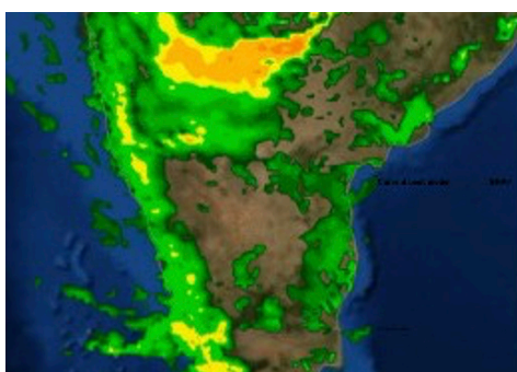
Current best model